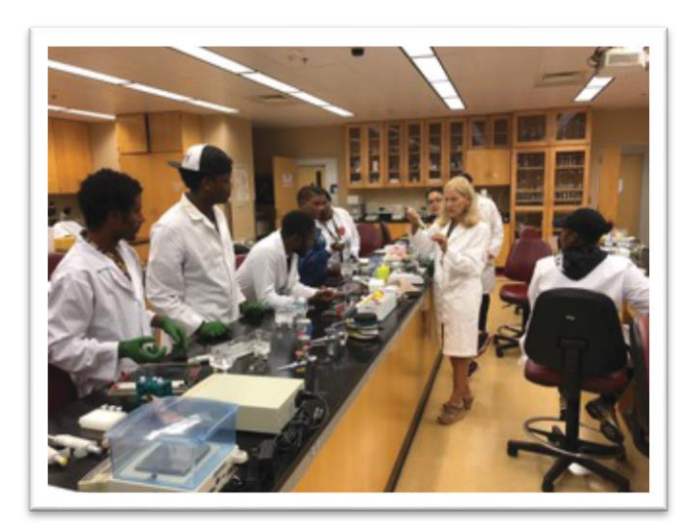
Trainees from the Baltimore BioWorks SIP receive technical instruction

Description: The Maryland Cyber Skills Alliance is seeking to address Maryland's shortage of skilled cybersecurity professionals by providing training that leads to industry recognized certifications and maps directly to IT jobs. CompTIA and Transmosis collaborate to lead the Alliance, and will provide training to unemployed, underemployed and incumbent workers. Participants will have the opportunity to earn a wide array of certifications, including A+, Network+, Security+ and Cybersecurity Analyst+. The partnership is in the planning stages and anticipates training 20 individuals over the next two years.