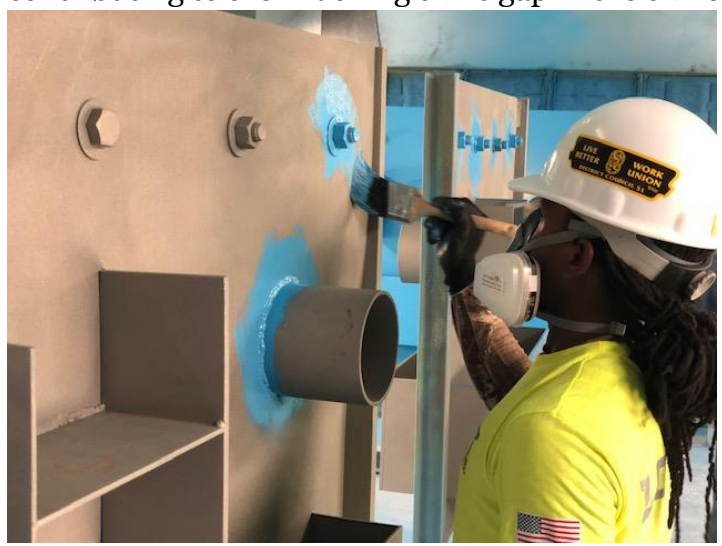
Participant from the Architectural Metal and Glass Initiative in training

A recent study published by Deloitte projected that the skills gap in manufacturing "may leave an estimated 2.4 million positions unfilled between 2018 and 2028, with a potential economic impact of 2.5 trillion." 4 Other industries that fall within the skilled trades are reporting similar numbers. Employers generally identify 3 main challenges that are contributing to the widening skills gap in the skilled trades: misperceptions of the industry,