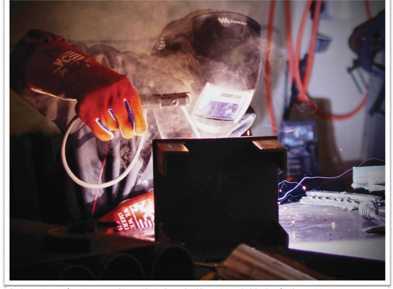
The Careers in Manufacturing Partnership provides in-demand welding training which leads to family-sustaining wages